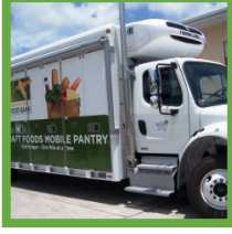
Treasure Coast Food Bank, Fort Pierce