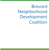
Brevard Neighborhood Development Coalition