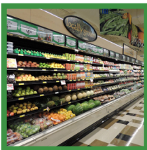
Hitchcock's Market, Old Town, FL

can help finance your Healthy Food project through one of our several lending programs. Here is an overview of financing guidelines through our Community Development, Food Access, and NMTC programs.