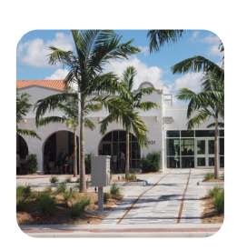
SW FLORIDA COLLABORATORY, FORT MYERS

historic redevelopment & nonprofit incubator $23.9 MILLION PROJECT $10 MILLION FCLF NMTC